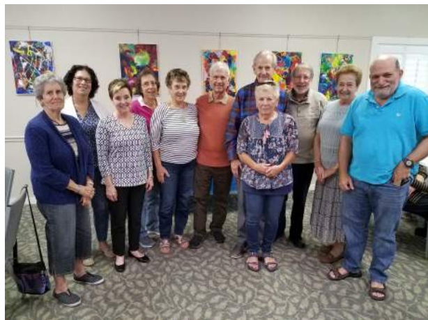
Newly elected officers and trustees