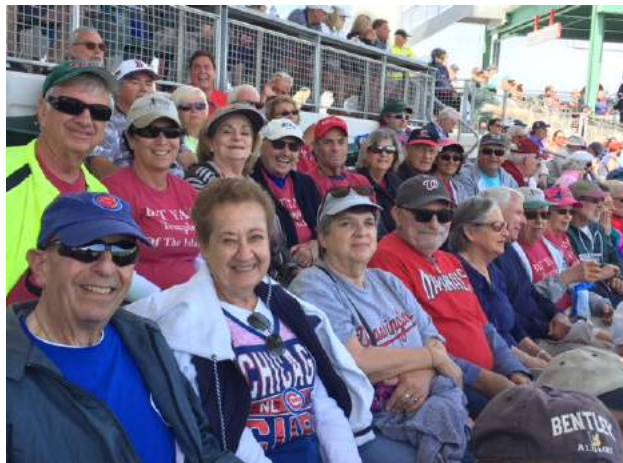
The Bat Yam gang enjoying the game between the Boston Red Sox and the Tampa Bay Rays, which ended in a tie